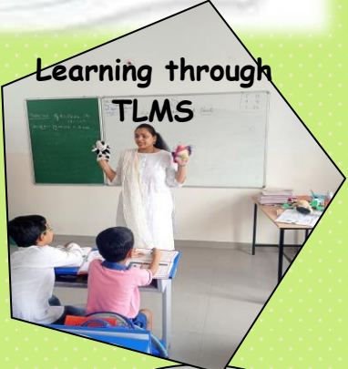
Learning through TLMS