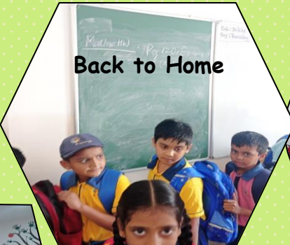
Back to Home