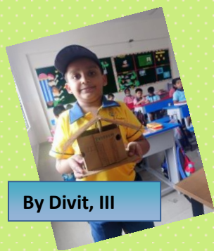
By Divit, III