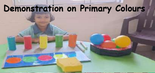
Demonstration on Primary Colours