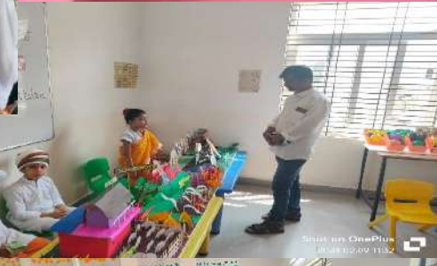
Encouraging Presence of Parents