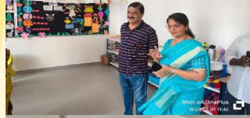
Encouraging Presence of Parents