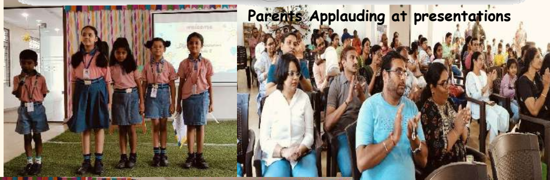
Parents Applauding at presentations