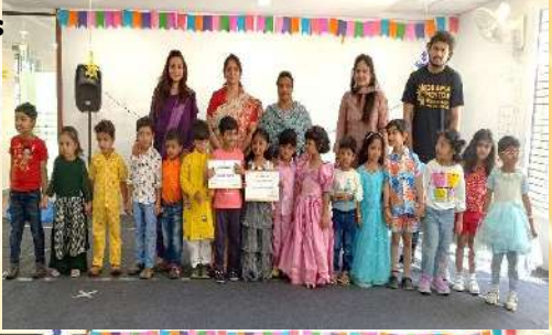
Ants and the grasshopper, The giant octopus