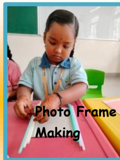
Photo Frame Making