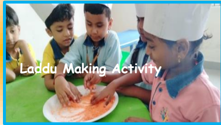
Laddu Making Activity