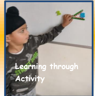
Learning through Activity