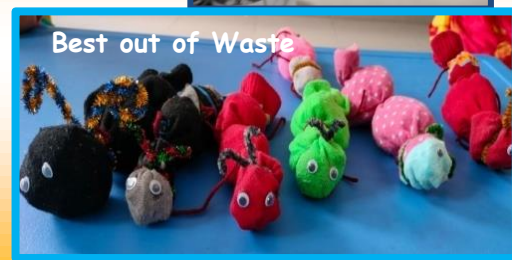
Best out of Waste